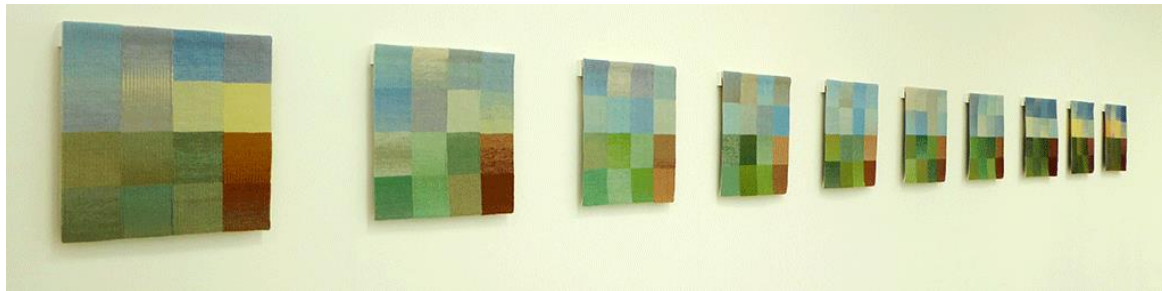
Allotted Time 1-10, 2016 40 x 40cm each 2016

I use tapestry weaving to portray ideas of passing time and this ties in beautifully with the slow method of creation. The time consuming nature of the process has at times frustrated me, especially during university when I was unable to create as much explorative or developmental work as other students using different methods. Despite this I believe quality is more important than quantity and the slow gradual creation of my work allowed me to reflect and develop my ideas throughout the making of only a few pieces.