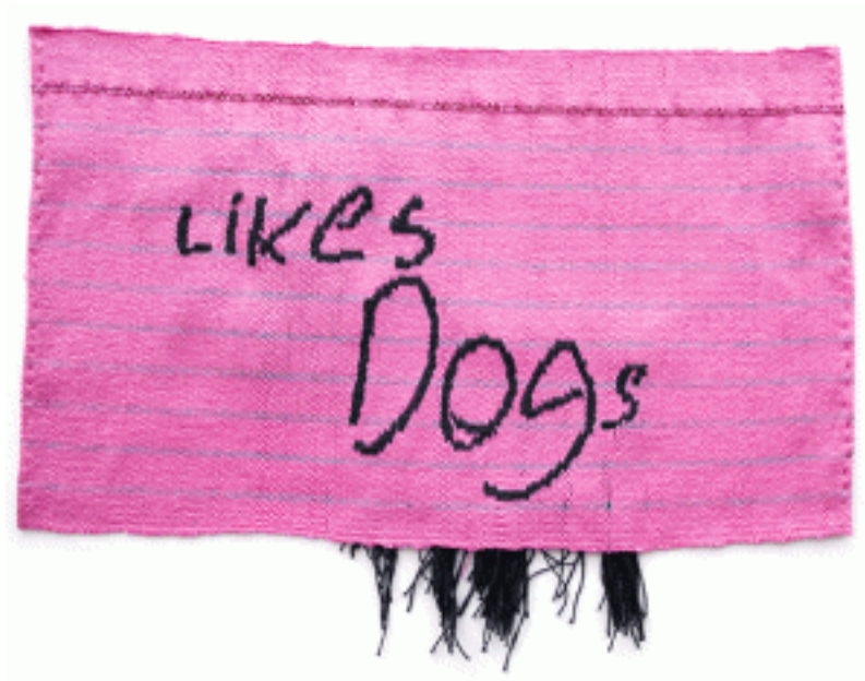
"Likes Dogs" (Found text project) Cotton, linen and acrylic yarn 20" x 12" 2016

Tapestry weaving allows me to make those texts tangible. A neat change of color separates background from writing, and using a different kind of yarn, maybe thicker or softer, allows the eye to appreciate the different tactile qualities of the work. Yarn works as ink and as paper, and the meaning of the text becomes more complex when loaded with the materiality of fiber.