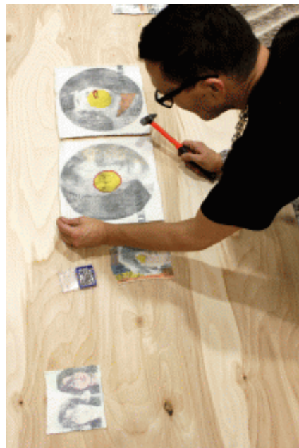
"Legend" was made and exhibited in the Tartu Art Kollege students exhibition "MAKING TIME" Jõhvi Concert hall- 2014

Although I'd prefer to use unorthodox methods and materials, I also cherish the history of tapestry which even influenced my own work to some extent. I use classical takes or forms that work well even when I make my other works, but I mix them with contemporary techniques. It would be great if these two aspects could be joined as it would create the element of surprise. I don't conform to certain rules but I still think it's important to preserve the traditional features of tapestry which, so that I could classify this work as tapestry. When it comes to the tapestry "Legend," I also wove a traditional surface with different yarns to get this meditative joy of weaving and then mixed it with the printing method – that was exciting for me.