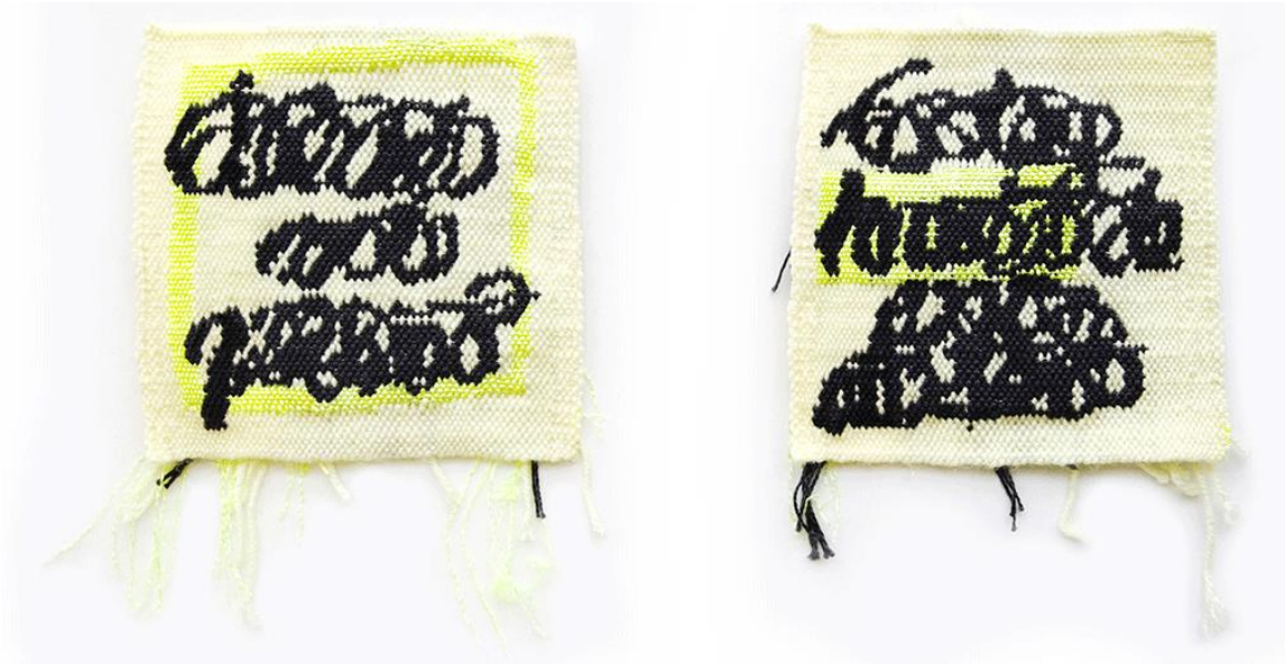
"Sick and tired" Acrylic yarn, neon rope and cotton 7.5" x 7.5" each 2016

right yarn and warp density to make your letters readable, to create smooth curves and to manifest the different thickness that a brush or marker can make.