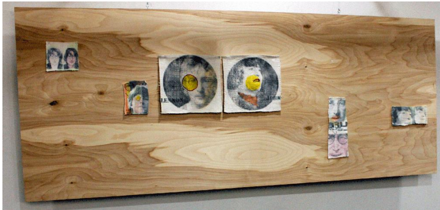
Birgit Uibo's tapestry "Legend"

makes you think about ingenuity. Often new ideas of weaving methods and use of materials are born.