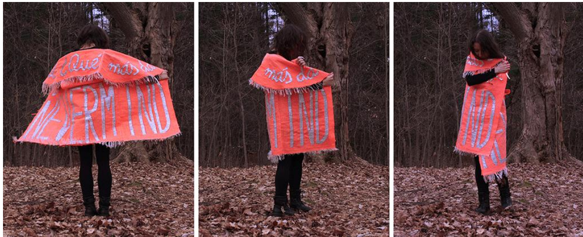
“Emotional Emergency Blanket” Cotton, shredded survival blanket and vinyl flagging tape. 52,5” x 45,5” 2016

Some years ago, I had the chance of spending a year abroad in Germany. I studied for two semesters in the Bauhaus University in Weimar (Germany) where I got to know the work of Gunta Stolz and other great weavers. Back in Spain, I happened to attend the same school that my mom did for a few months. There I tried different skills, such as spinning, dyeing, and weaving. But it was not until last year, when I moved to America to pursue graduate studies in Fiber Art at the Cranbrook Academy of Art, that tapestry weaving became part of my artistic practice.