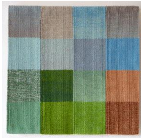
Allotted Time 4, 40 x 40cm Cotton warp, wool weft 2016

I discovered weaving at the beginning of my second year at university. I was inspired by the artist Sheila Hicks and I was fascinated by the range of textures and effects that could be created with the medium. At an early age I was taught to knit and sew both by hand and on the machine and I enjoyed the notion of creating something from nothing, improving my skills and learning new techniques. Before university I was always interested in textiles and using my creative skills both during my studies and in my free time. Tapestry was something I had never tried before and I was inspired by the challenge to learn a new technique, as well as research the history and connotations of the method, and allow this to influence my work.