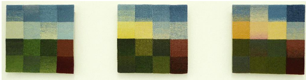
Allotted Time 8, 9 and 10, 40 x 40cm Cotton warp, wool weft 2016