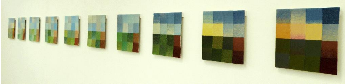
Allotted Time 1-10, 2016 40 x 40cm each 2016

Throughout my time at university, I experimented with lots of different materials from natural found objects such as leaves and twigs to manmade carrier bags. With my subject matter being landscape I was interested in including objects that I found in these environments in the actual weaving. This is another element that makes tapestry unique in that once the warps are set up many different things can be used as the weft. I also experimented with natural dyeing techniques using onion skins, nettles, paprika and red cabbage to dye my yarn. Again, this connected the pieces much more closely with their subject matter of landscape and also linked my work back to historic tapestries as this is how they would have coloured their yarn.