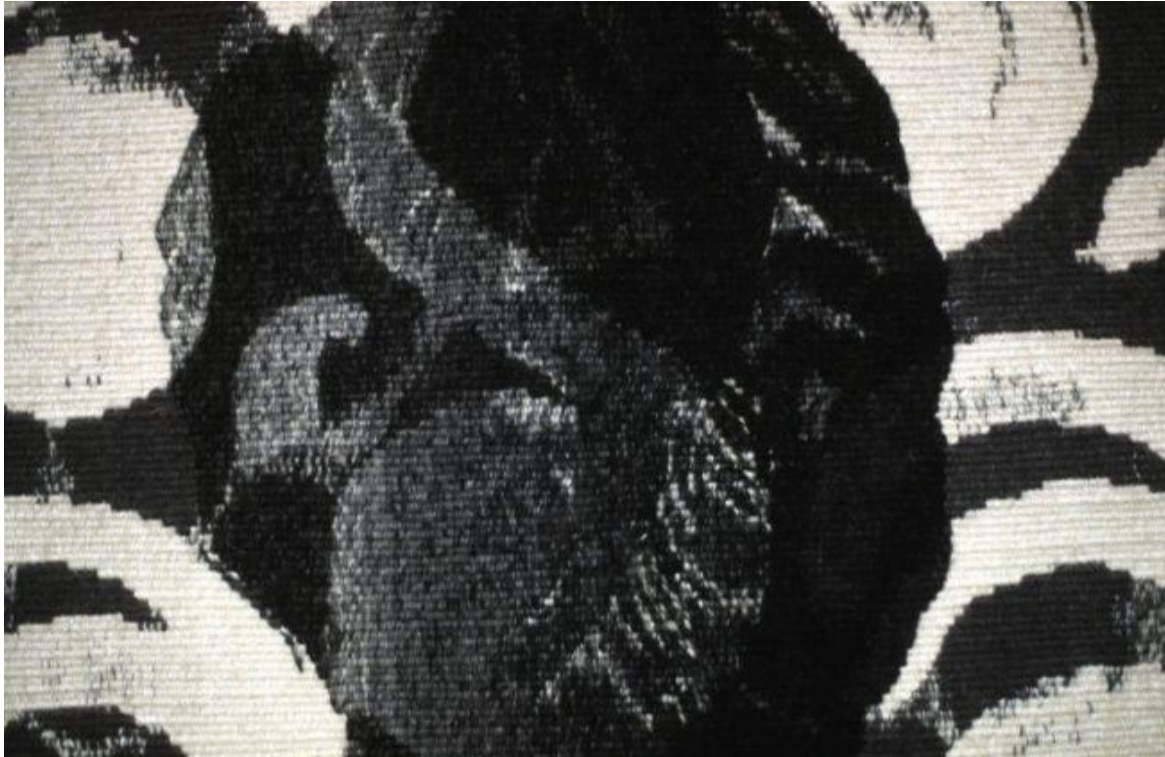
Joan Baxter, “Woven Monochrome Print”

I am very proud that I have supported my household through my tapestry activities for 40 years, an accomplishment not possible without skills learned and practised in studios. In a perfect world, aspiring tapestry weavers should spend at least a year working in a studio as part of their training.