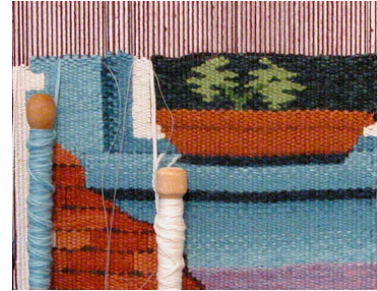
Weaving in progress, showing how the horizontal, colored weft completely covers the vertical white warp in a weft-faced weave.

Weft-faced – Fabric in which only the weft threads are visible.