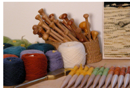
Wool weft yarn, high warp bobbins and beater

Bobbin – Tool on which the weft is wound in an orderly fashion and which is passed between the sheds of the warp. A pointed bobbin is traditionally used in high-warp weaving. A bobbin with two blunt ends is traditionally used in low warp weaving.